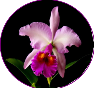
C. Claesiana