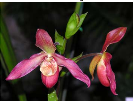
Best Phragmipedium - Phrag. Sargent – Owner Al Sugano