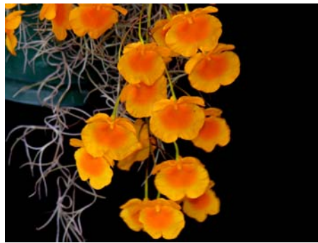
Best Species – Aggregatum - Owner Gwen Teragawa