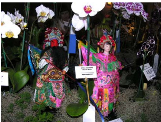
Left, Chinese opera puppets representing China, Taiwan and Singapore; right Buddhist carvings representing Vietnam.