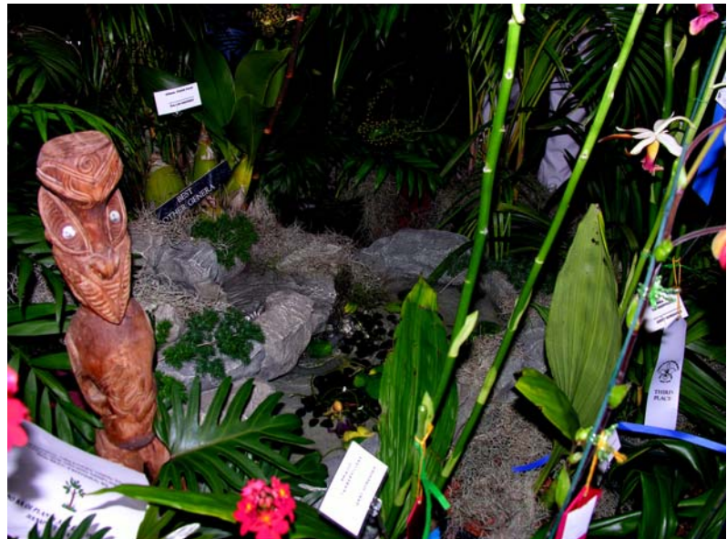
The club fountain, with carving from the South Pacific

Those people who came loved the show and especially like the setting with the theme and the artifacts from other parts of Asia and the Pacific Rim.