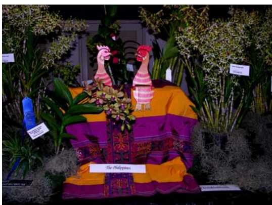
Left, roosters and native dress representing the Philippines; right, a Hindu deity representing India and Sri Lanka.