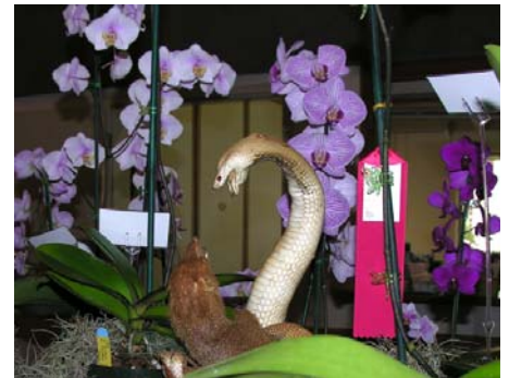
Thai Classical Dancers, sitting Buddha and cobra with mongoose representing Thailand