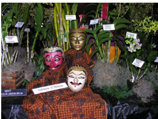
Left, masks for Wayang Dancers from Indonesia and Malaysia; right, koala bear and boomerang representing Australia and New Zealand