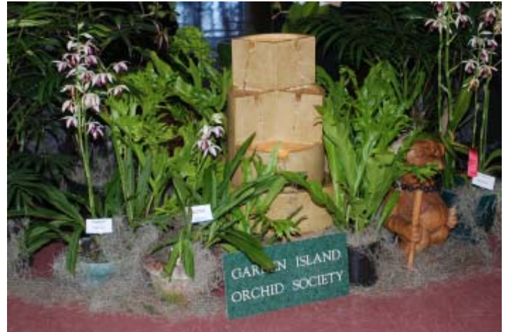
The artsy fountain was a big success.

We of the Garden Island Orchid Society and the Members of the Hanapepe Economic Alliance can give ourselves a big pat on the back. At least that was what we heard from our visitors. From all accounts our orchid enthusiasts said it was one of the best shows they had seen. They liked the combination of Orchids and Art and the sheer variety of our orchids. Of course there were many helping hands, too many to list here but we hope to recognize all who participated in creating the show at a later date. For now enjoy the photos and congratulations to the winners and all entrants for a job well done. Spring Fantasy 2007 as expressed in photos.