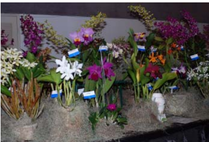
Art surrounded by orchids was a pretty touch.