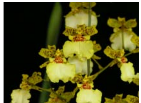
Best Oncidium - Colom. Sphacante #1 x O. Pirareuse - Owner Orchid Alley