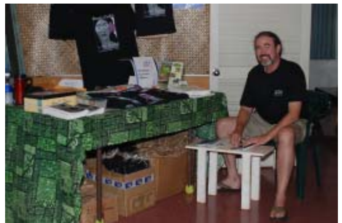
The Hanapepe Economic Alliance information table.