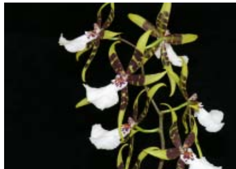
Best Brassia - Brsdm. Wild Warrior 'Chieftan' - Owner Orchid Alley