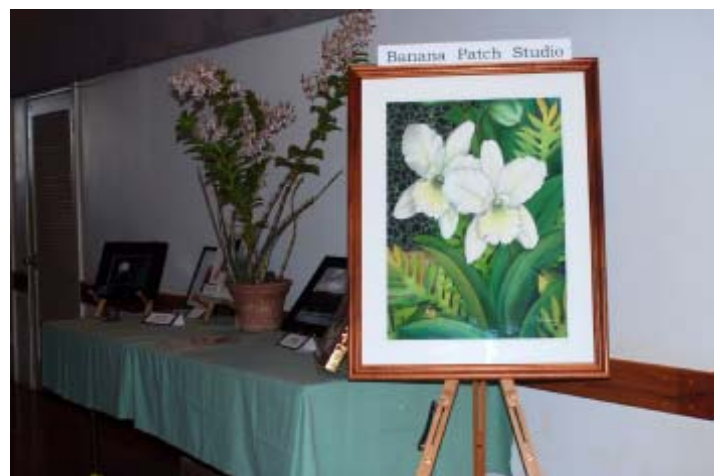
More show photos on Page 5.