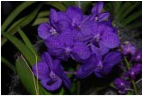
Best Ascocenda Alliance - Ascda. Princess Mikasa 'Sapphire' - Owner Orchid Alley