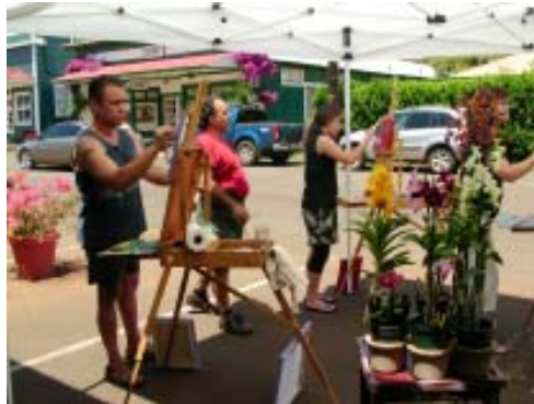
Several plein air painters paint images of downtown Hanapepe, and, of course, orchids.