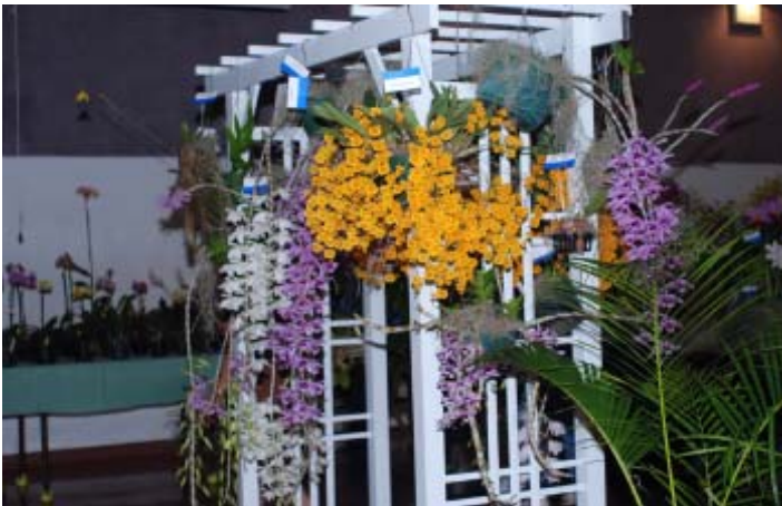
Our trellis this year was laden with hanging orchids.