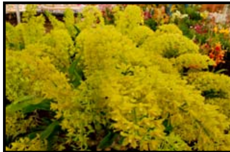
Best of Show, Orchids in Paradise 2010