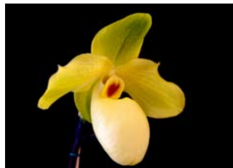
Paphiopedilum Single Flower Yellow 1 st Place: Paph. Pinocchio 'Hsinying' x armeniacum - Owner Allen Yamada