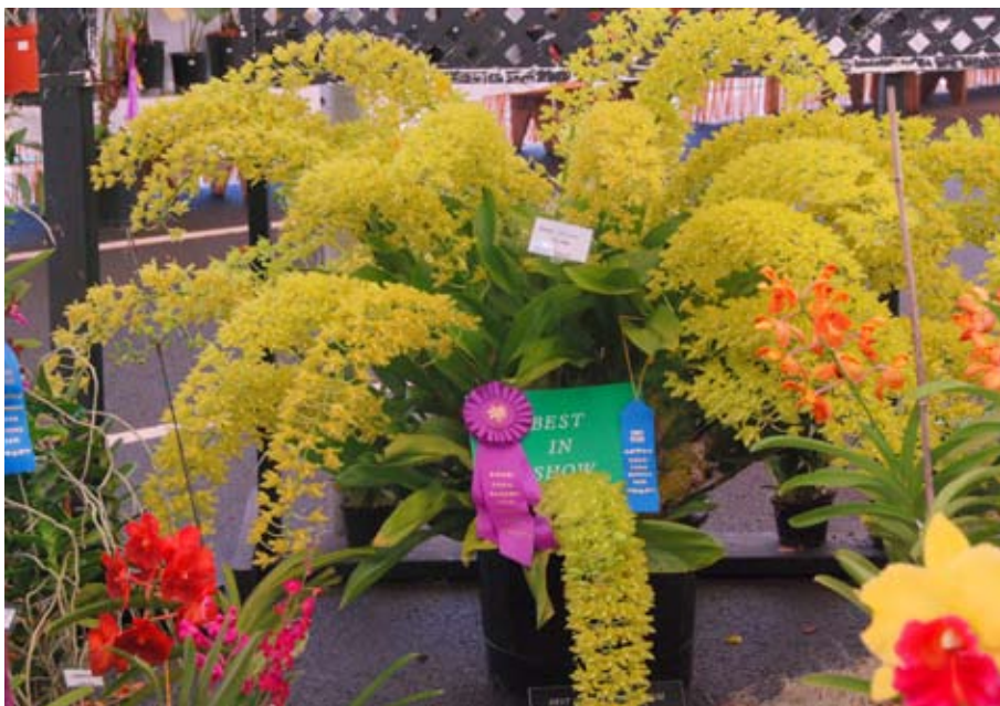
Best in Show - Gram. citrinum 'Hihimanu' - Owner Dee Dee Gorospe.