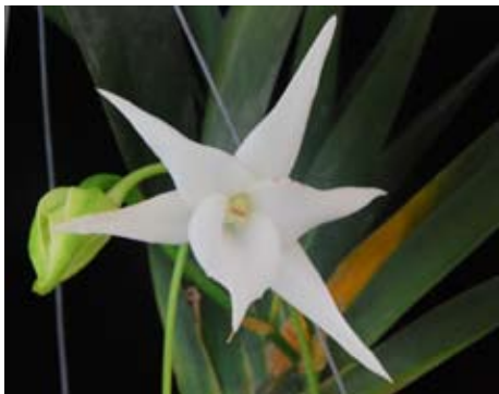
Left: Best Angraecum Angraecum Lemford White Beauty - Owner Orchid Alley