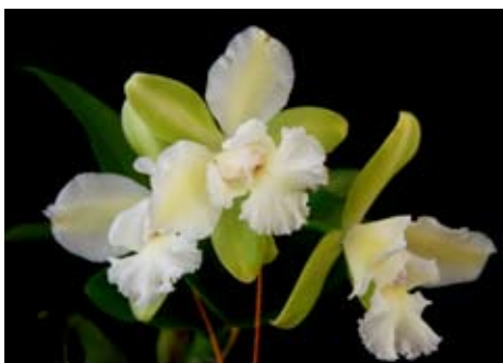
White Cattleya - 1 st Place: Epc. Siam Jade 'Avo' AM/CST- Owner Gwen Teragawa