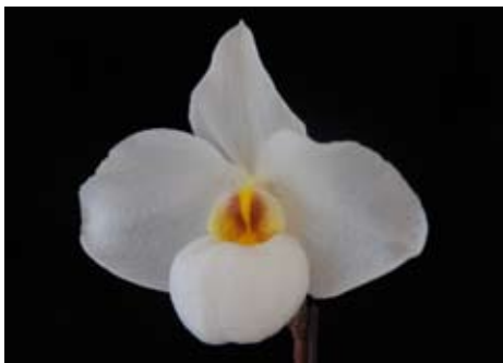
Paphiopedilum Single Flower Other Color: 1 st Place: Paph. Armeni White - Owner Al Sugano