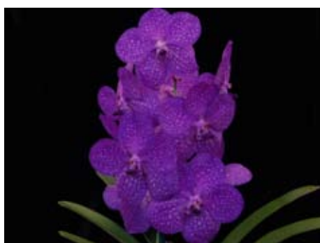
Vanda Alliance: Ascocenda: 1 st Place: Ascda. Mikasa 'Sapphire' AM/AOS – Owner Orchid Alley