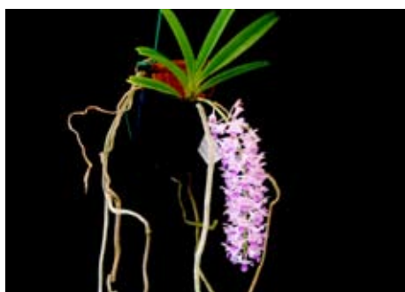
Species: 1 st Place: Rhynchosstylis retusa – Owner Orchid Alley